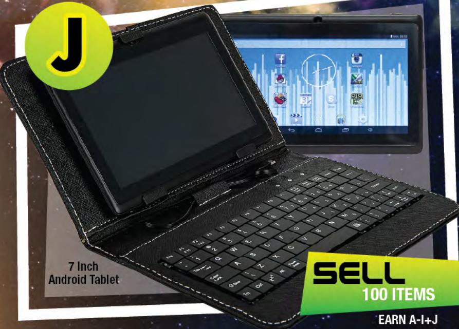
7 Inch Android Tablet