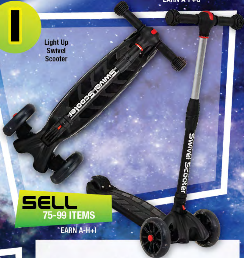
Light Up Swivel Scooter