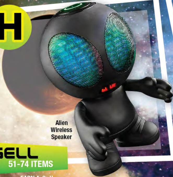
Alien Wireless Speaker