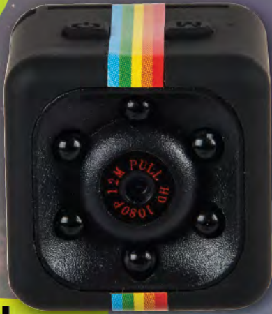
Micro Sports HD Camera